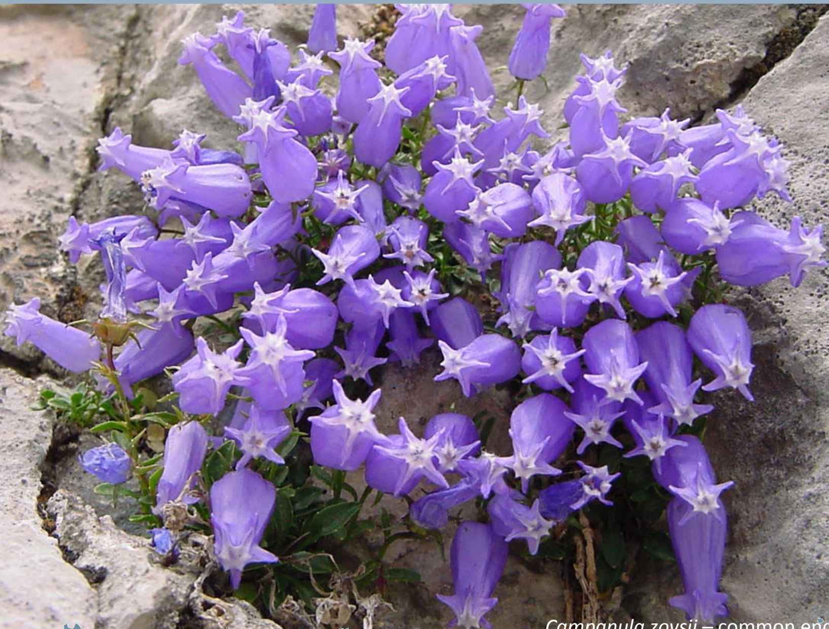
Campanula zoysii – common endemism